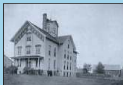
This poor farm building was built in 1886 and razed in 1997.

Eastmanville Farm in Polkton Township was the site of the former Ottawa County poor farm. The park's master plan calls for a "memory grove" that will provide historic information about the site and reflect on the long history of the property as a home for indigent people. Many families still have ties to the property through relatives that lived a portion of their lives there. The Memory Grove will be a small plaza in a grove of mature trees west of the park entrance. The project, scheduled for completion in early 2012, will include parking, benches, a planter, and interpretive signs that tell the history of the property including stories about the residents and their lives on the working farm.