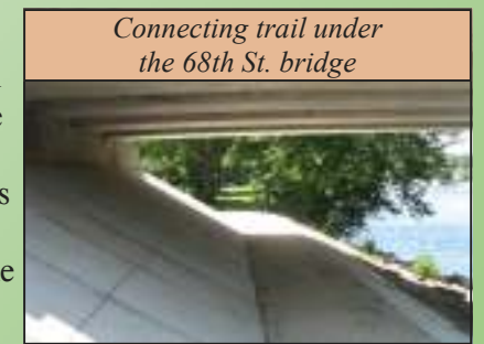
Connecting trail under the 68th St. bridge