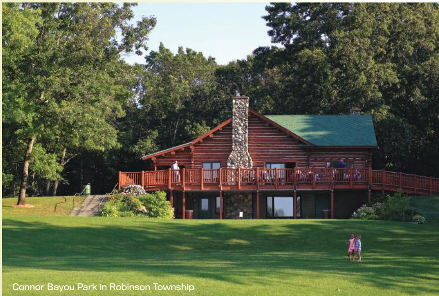
Connor Bayou Park in Robinson Township

ment for the past 20 years. Its goal: protecting thousands of acres of natural lands, creating green infrastructure, developing new recreational opportunities and connecting communities.