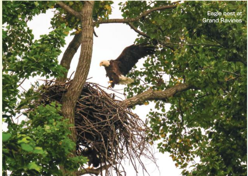
Eagle nest at Grand Ravines