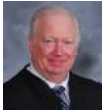
Judge Kent Engle