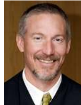
Judge Jon Hulsing